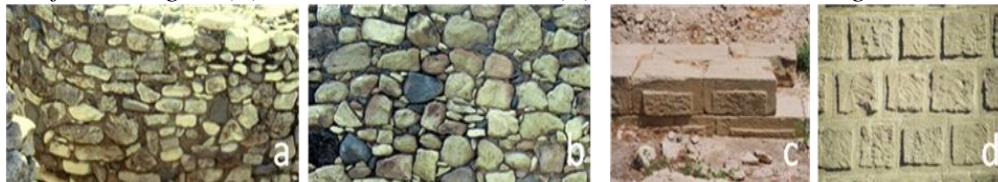
Figure 2. Different Types of Stone Walls. Walls with Rubble Stones (a) Prehistoric Structure, (b) Traditional Dwelling and Walls with Ashlar Showing Drafted Margins (c) Prehistoric Structure, (d) Traditional Building

Structural reasons and especially the need for stability led the traditional builder to the erection of thick stone and mud brick walls of 50cm. At the same time the thickness of the wall has an interesting aesthetic result. The substitution of the original thick walls of the traditional way of building with thin walls in contemporary architecture leads to a substantial aesthetic construction change.