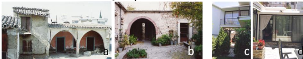
Figure 3. Houses with Central Courtyard - a,b: Vernacular Buildings, c,d: Modern Movement Houses of Neoptolemos Michaelides

A close investigation of the bioclimatic features and sustainable development of vernacular architecture showed a very small fluctuation in the temperatures in the interior of traditional dwellings compared with the larger fluctuation of the external environment. It also underlined the microclimatic significance of the central yard keeping the temperature at a higher level during winter.