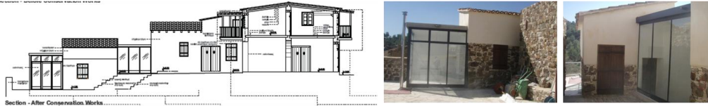
Figure 4. Conservation of a Traditional Settlement with the Addition of New Contemporary Structures

Giovannoni underlines the respect for the conditions of the setting of historic buildings, which should not be altered by inappropriate isolation or by the construction of new adjacent buildings incompatible in massing, color, or style. When filling empty gaps in a traditional urban area a continuity in the urban fabric that follows the detached system is achieved but at the same time a discontinuity in morphology is created as the completion is desired to be carried out with a contemporary architectural concept, so that the new will differ from the old with regard to the materiality and form, bearing the stamp of its time. Mario Botta also remarks: The old needs the new in order to be recognizable and the new needs the old in order to engage in a dialogue with it (Denslagen 2009).