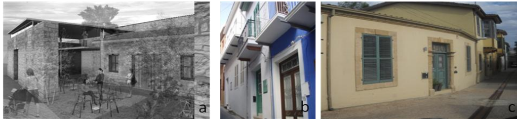
Figure 5. Different Strategies for Completing the Form of Traditional Dwellings a: with the Use of New Materials and Style, b,c: without any Distinction between the Old and New